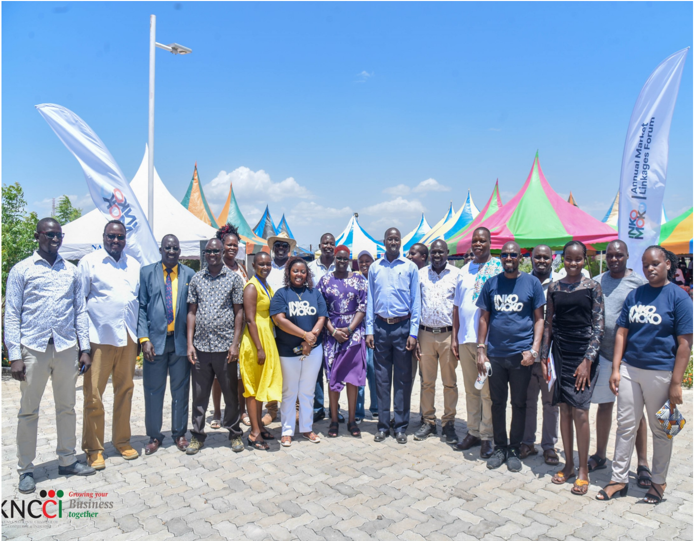
BDS stakeholders at the INKOMOKO Annual Market Linkage Forum Launch in Kakuma