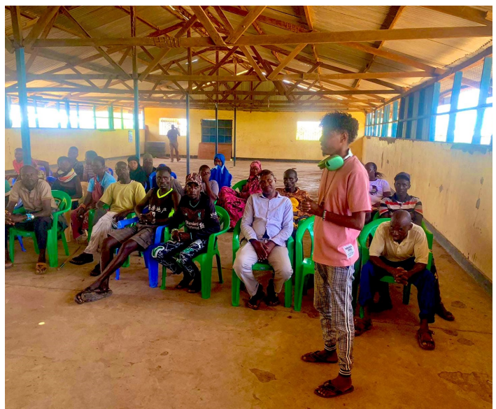
Youth in Turkana West addressing TCCI and other stakeholders during PPD

Turkana County - KNCCI in partnership with GIZ Kenya for PPD forums, emphasizing socio economic advancement in Turkana West. Targeting youth refugee and host community entrepreneurs , these forums strive for inclusive prosperity and self-sufficiency through ProSEET