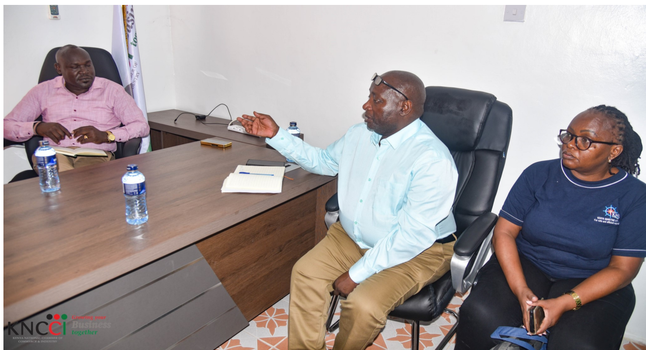
KMA Director General at TCC office in a meeting with Chamber leadership deliberating on investment opportunities in the maritime sector

In a bid to explore untapped investment opportunities, the Kenya Maritime Authority (KMA) paid a courtesy call to the Turkana Chamber office. This strategic meeting aimed to introduce the KMA team to the intricacies of the Turkana Chamber while delving into discussions surrounding potential investments in the region's maritime sector. Central to the discussions was the recognition of Lake Turkana's potential for economic development.