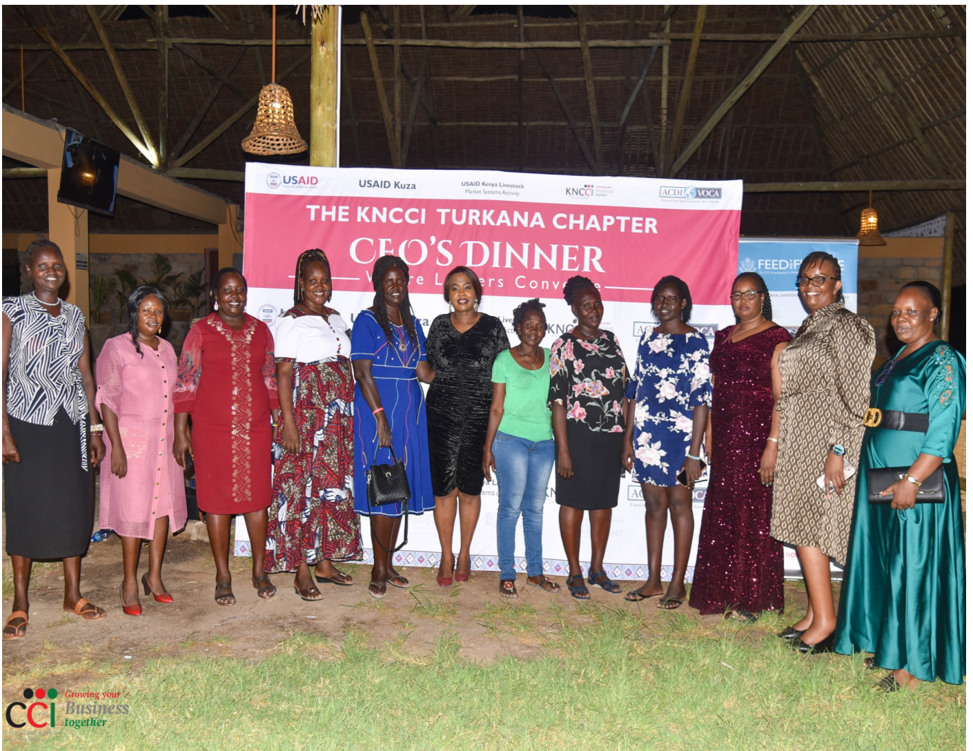
Turkana Women in Business at the CEO's dinner