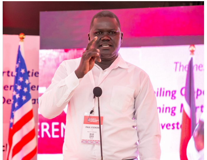
TOCI CEO pitching at the Turkana and West Pokot NKIC conference