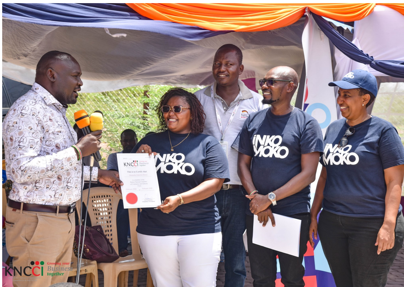
TCC chairman awarding INKOMOKO their membership certificate during annual market linkage launch

Business communities in Turkana West and Uasin Gishu are set to see a rise in economic activities as INKOMOKO launches annual market linkage forum.