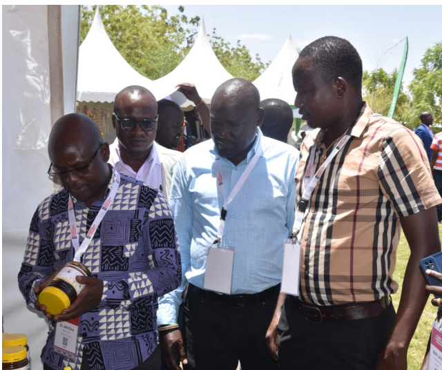
Turkana Deputy Governor visiting booths at the NKIC conference