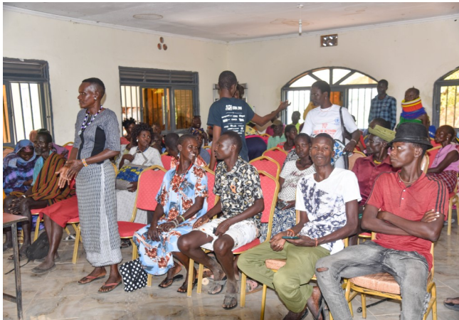
Turkana North business community during the advocacy and formalization activity

With the support of ILO Prospects, these meetings signify a significant step forward in formalizing partnerships and strategies for sustainable development in the region. By using sources and expertise of both the KNCCI and the ILO, participants are set to develop comprehensive approaches that address key challenges while making use of opportunities for economic growth and social progress.