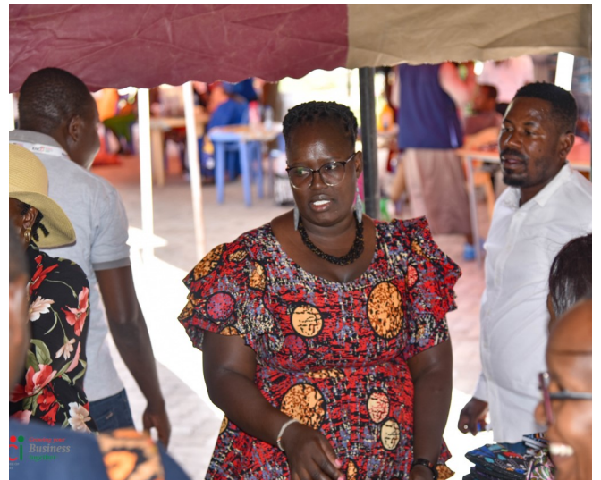
Interactive session of prospect clients and entrepreneurs at the Annual Market Linkage forum