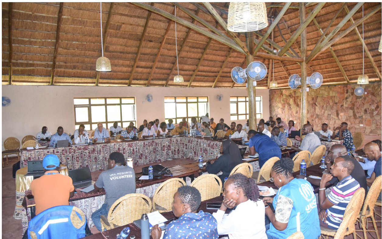
KISED P stakeholders at the quarterly meeting

We have been committed to supporting such initiatives and driving positive change within our community through working on and championing for the inclusivity of PWDs in entrepreneurial spaces. . Through partnerships with stakeholders from diverse sectors, we strive to amplify the impact of programs like the KISED P and ensure that their objectives translate into tangible outcomes for those they aim to serve.