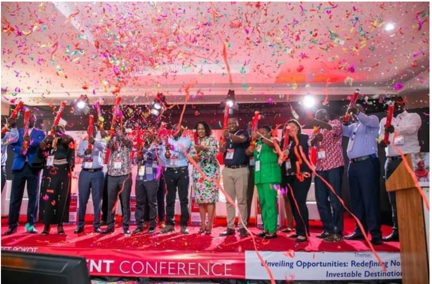
Celebrating the Northern Kenya Investment Conference in Turkana and West Pokot