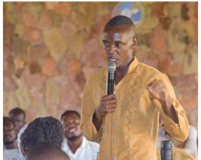
Innocent, a stakeholder from Kakuma Refugee Camp at KISED stakeholders meeting voicing issues in his sector