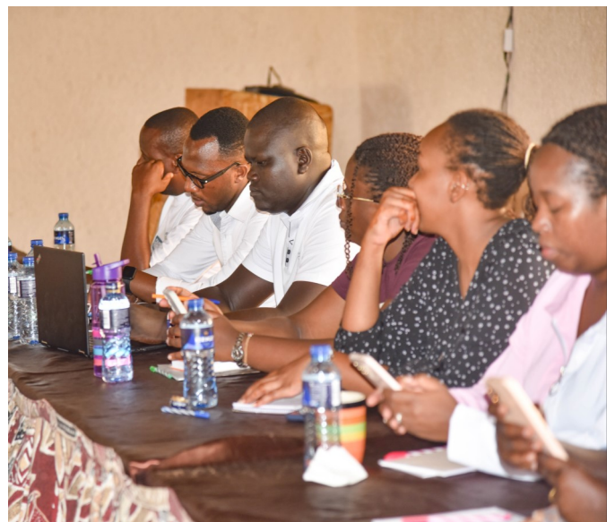
KISEPD Stakeholders in a meeting